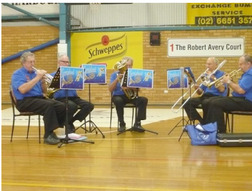
The Tarnished Brass in concert at SportzCentral